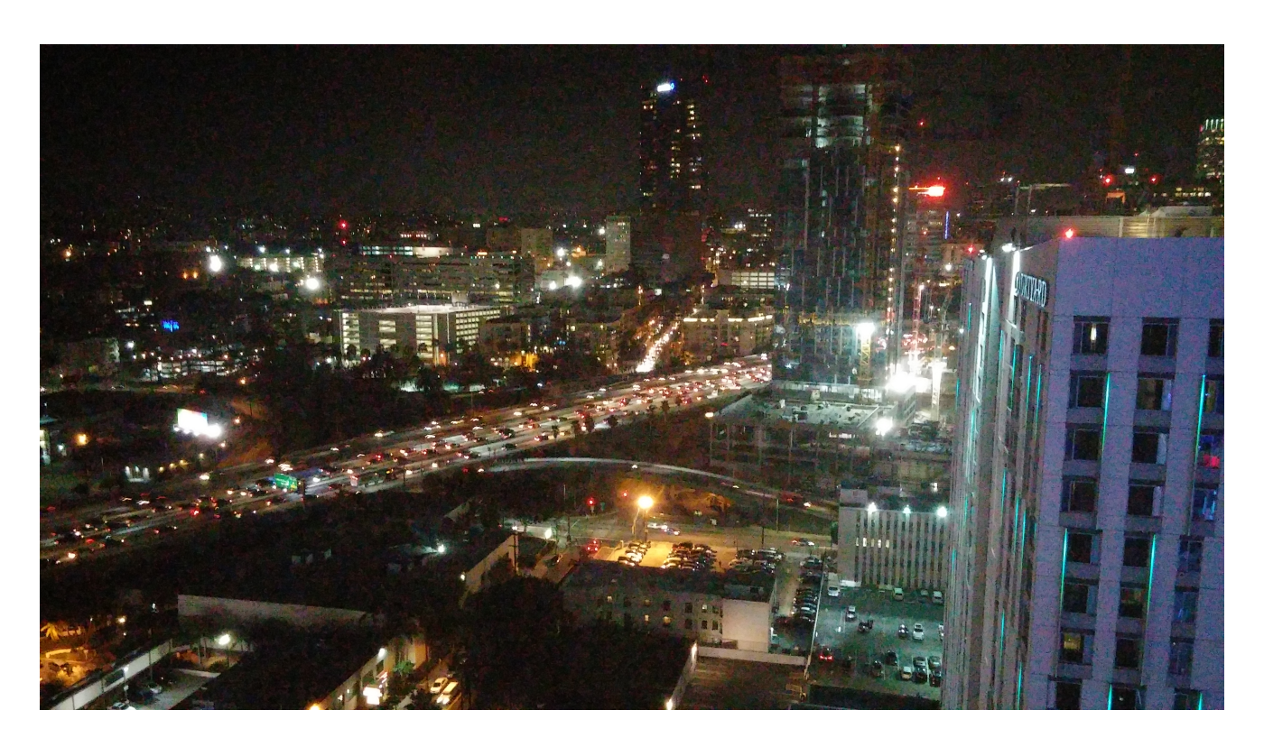
- Ritz Carlton Wolfgang Puck Staples Ctr 012016.jpg -